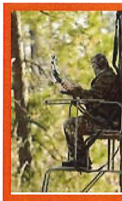
Tree Stand Safety

Falls from a tree stand can happen at any time after you leave the ground. No matter what type of tree stand you are hunting from, every hunter should practice tree stand safety by wearing a safety harness with a lifeline from the time they leave the ground until they return.